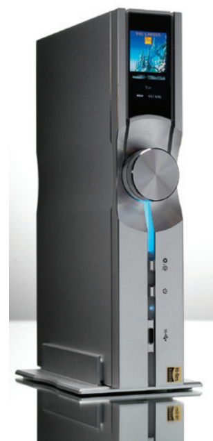
iFi Audio's slender ZEN Stream network player, p17