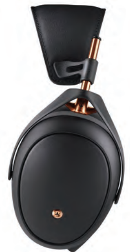
Meze Audio's Liric: closed-back planar magnetic headphones