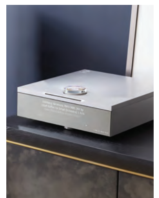
Linn: the world's best streamer?