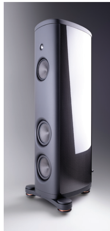
Magico S2 loudspeakers (p4) all the effort in set-up pays off in a remarkable sound