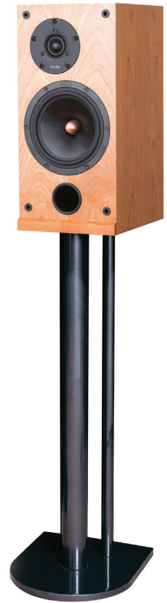
Proac Response D Two on page 8