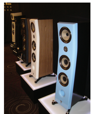
News from the Autumn Shows, page 48