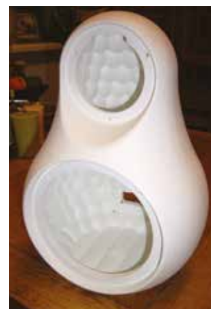
JERN14 DS, page 18