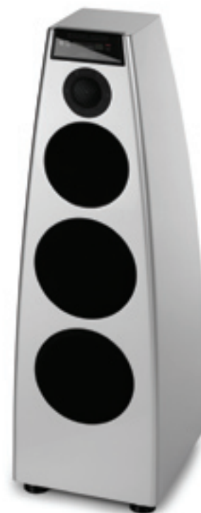
Meridian's DSP 7200 speaker page 12

Mains accessories including the sublimely ridiculous