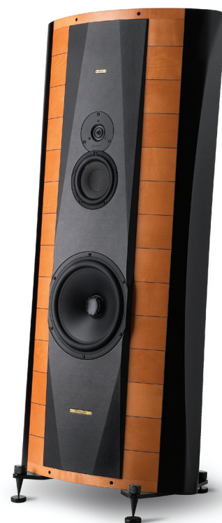
Sonus Faber Elipsa page 34