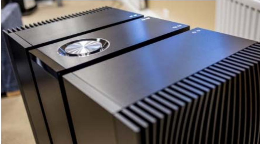
NAIM Statement NAC S1 pre and double NAP S1

NAIM presented the Statement NAC S1 pre and double NAP S1 monoblock power amplifiers driving the top of the line Focal Grande Utopia BE EM , the one with the regulated and adjustable bass electromagnet power supply.