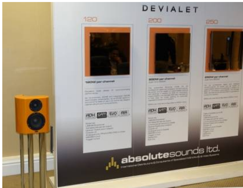
Crystal Minissimo (which is much heavier than it looks!)

In Absolute Sounds third room, this the largest, that relatively compact Magico floorstander, the S3 (HIFICRITIC Vo18 No3), was driven by the latest Constellation amplification, sounding particularly fine replaying a Mozart piano concerto to a substantial and notably spellbound audience.