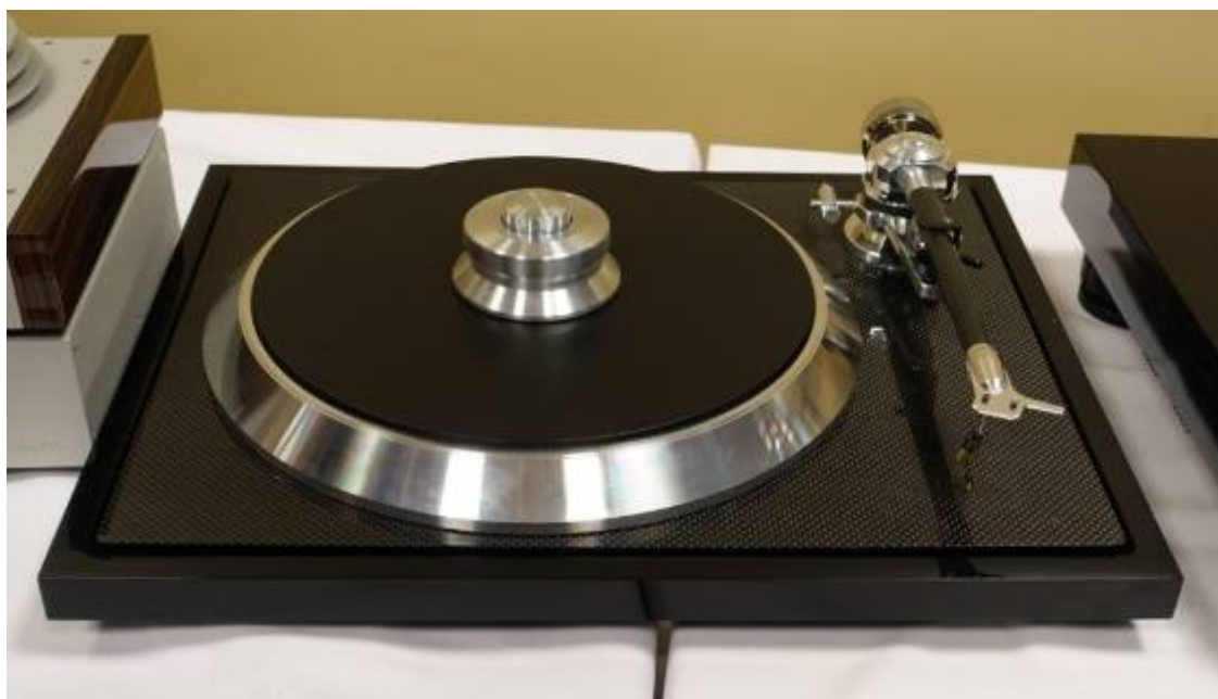
EAT . Another new, nicely engineered turntable, the C-Sharp , this time with carbon fibre and an EAT aluminium alloy and carbon fibre arm, available from Absolute Sounds . EAT headed by Jozefina Lightenegger, is also responsible for those custom thermionic valves.