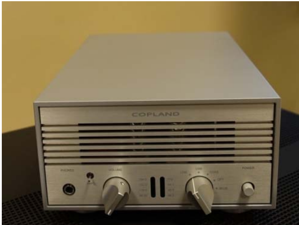
The handsome new Copland DA150 DAC and headphone preamplifier here is mock up form.