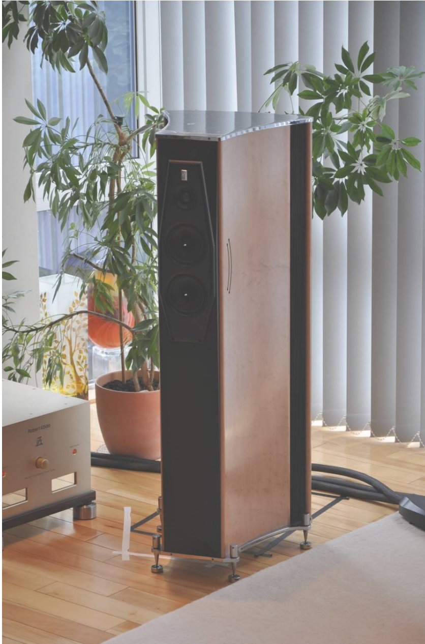
Franco Serblin Ktêma

Audio Momentum showed the Franco Serblin Ktêma with high end electronics in a relatively small syndicate room. I need not have worried, the speaker showed that delicacy and intimate musical insight which I had experienced from it in review (Vol 5 No3 )