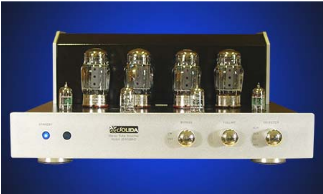
Jolida integrated valve amp the JD 502 BRC

I popped in at AudioSmile and again marvelled at their three way modular active bass system showing a commendable punchy grunt in the bass, enquired about a review and was told that my editor was already under way on this for HIFICRITIC!