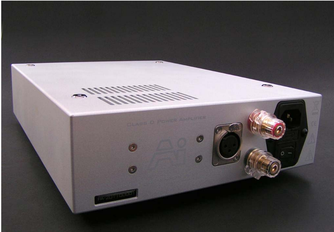
AcousticImagery Power Amplifier MonoBlock