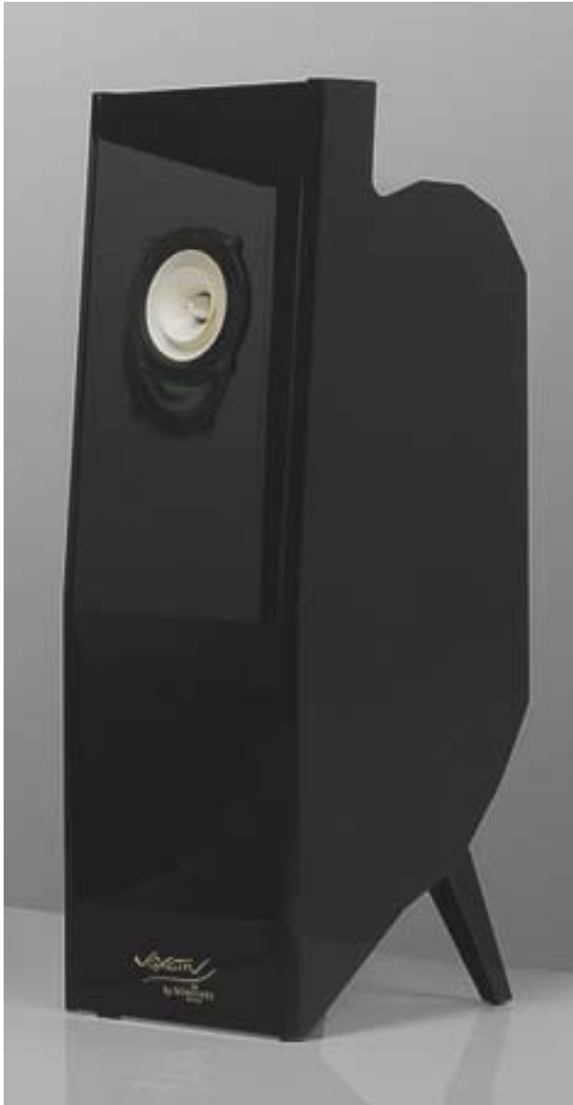
Voxativ full range driver back horn loaded loudspeaker

With our forthcoming interview for and coverage of the new Voxativ full range driver, I caught some of this action in the Schimmel room with their striking, piano black, of course, full range horns.