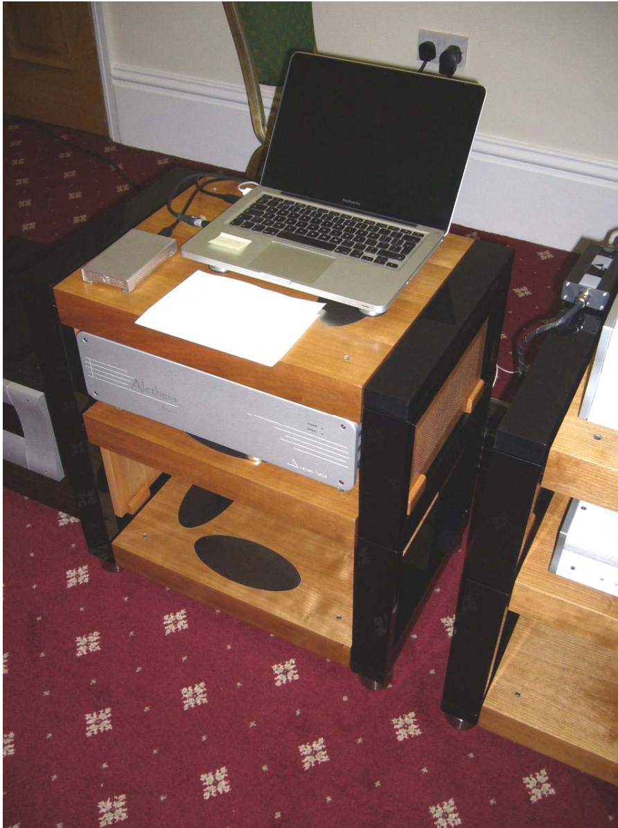
Vertex AQ -Kaiser LeadingEdge support tables showing the Oval damping inserts

I've long been a fan of Vertex AQ 's approach to setting up a system by paying particular attention to a coherent pattern of cables, support furniture and accessories, largely by applying an unusual degree of mechanical damping and acoustic absorption. To these ears, the demonstration using the Aletheia dac-1 DAC, VTL amplification and Kaiser Kawero Vivace speakers, was certainly one of the highlights the show.