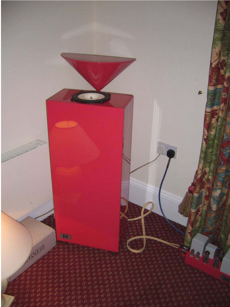
HOWES QUARTERWAVE The Howes Quarterwave speaker is based on a 1970s DIY design

The drive units from Berlin based Voxativ could be heard in several rooms.