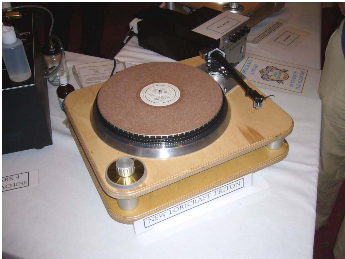
LORICRAFT Loricraft's new idler-drive Titan turntable

Vinyl too was well represented by several costly new turntables. These included a very purposeful looking thread-drive newcomer called Palmer , built on a birch-ply chassis and fitted with a Scottish Audio Origami PU7 tonearm, in a room operated by the expanding Kronos Audio Visual operation. Loricraft has always favoured idler-wheel drive for its Garrard-type revivals, and is applying that to a new Triton model.