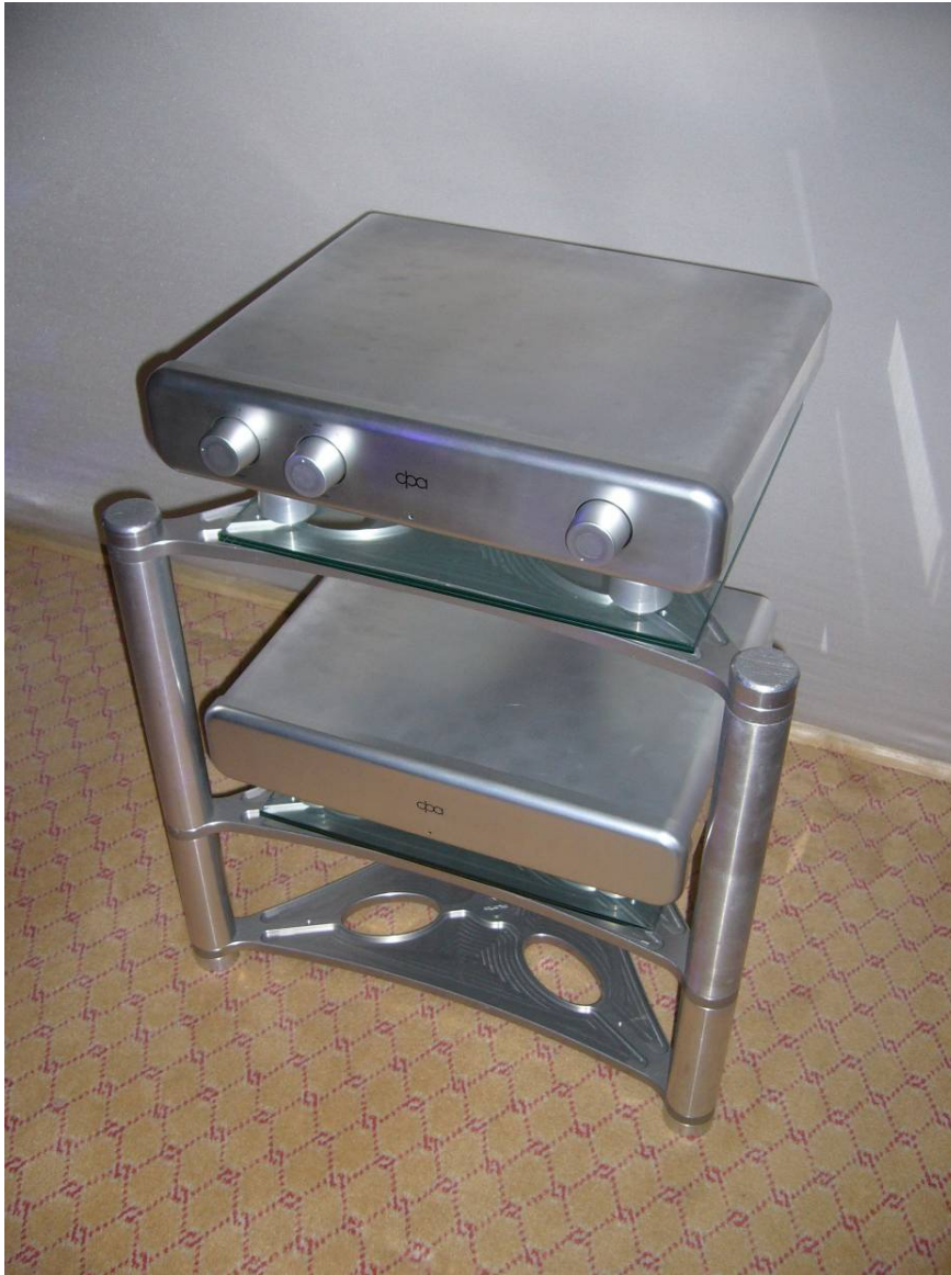
The New Deltec amplifiers