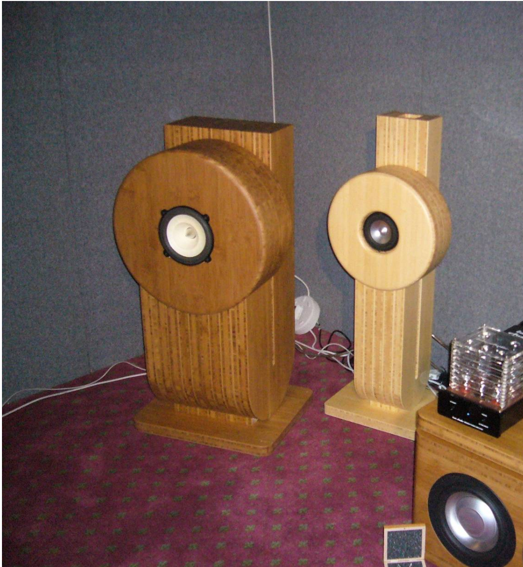
JOSOUND JoSound's new heavyweight bamboo transmission line (left) uses a Voxativ AC-2.5 driver

The same driver was also found in the compact Howes Quarterwave speakers that Music First Audio was using with their transformer-based passive pre-amps. (see Vol. 5 Issue 3, for review)