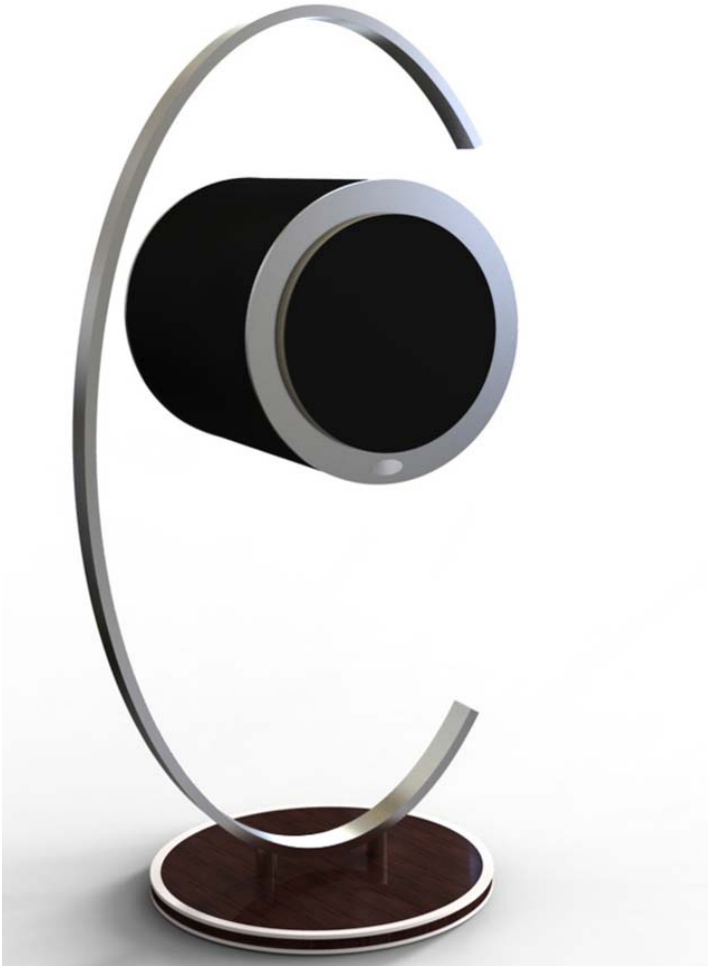
Origin Live: (suspension cords not shown )

I popped in the Origin Live room and saw their new suspended speakers, these a set of prototype interpretations for now, and they also admitted to some acoustic problems for which solutions were already being found. They looked striking while the arched support took considerable space, seeking an open location in a listening room.